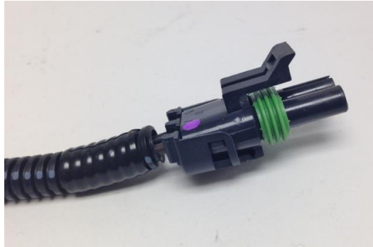
Figure 1 - Washer Pump Connection